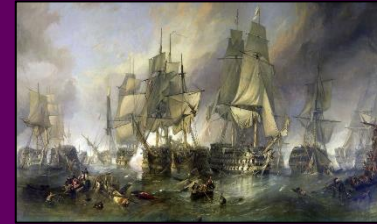
The Battle of Trafalgar 1805