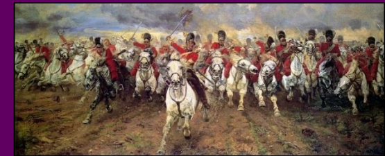
The Battle of Waterloo