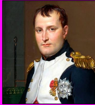
Napoleon Bonaparte – Napoleon I of France Waterloo