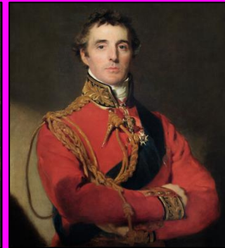
The First Duke of Wellington