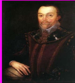
Vice Admiral Sir Francis Drake