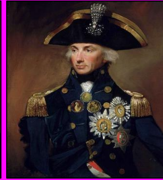
Admiral Horatio Nelson