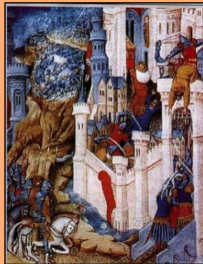
Sack of Rome 410