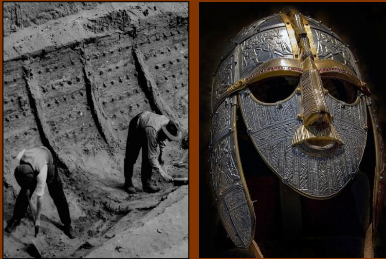
Sutton Hoo Ship Burial, Suffolk