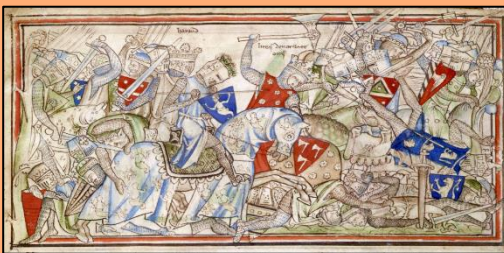
Battle of Stamford Bridge 1066