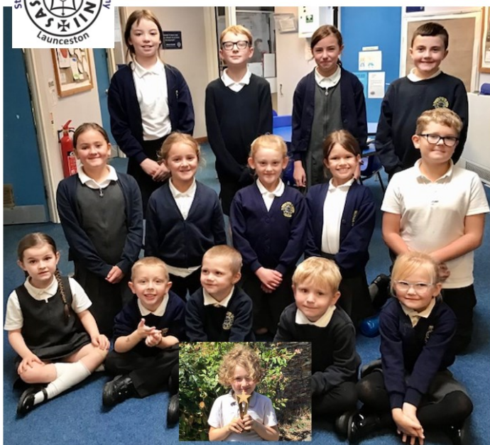
St Stephens UNICEF Steering Group-Going for Gold

R: Rights. We may be small in size but our Rights are not!