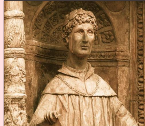
Pliny the Younger