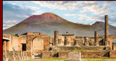
Pompeii and Vesuvius