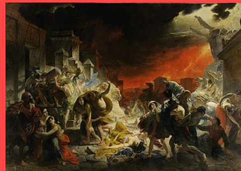
The Last Day of Pompeii by Karl Brullor 1828