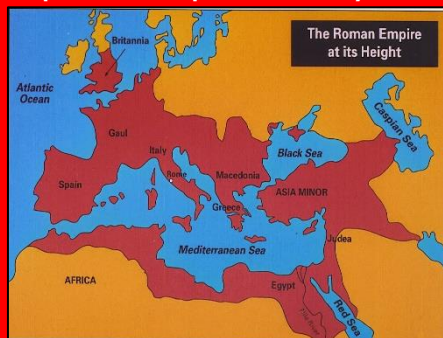
The Roman Empire