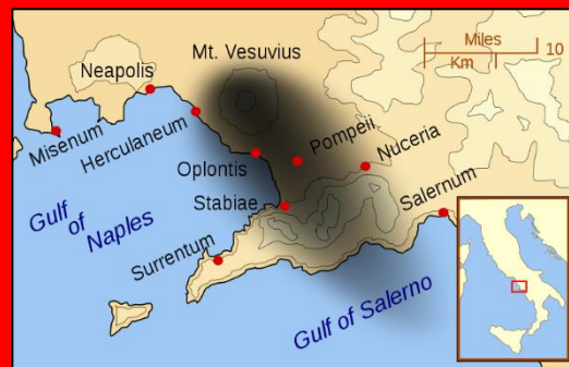
The location of Pompeii and Vesuvius in Italy and the spread of the ash cloud